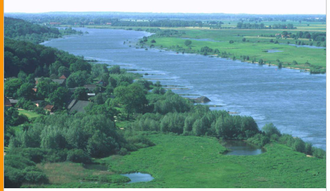
Elbtalaue-Wendland: Preview of the landscape to be explored during the European Rural Sustainability Gathering in October 2009